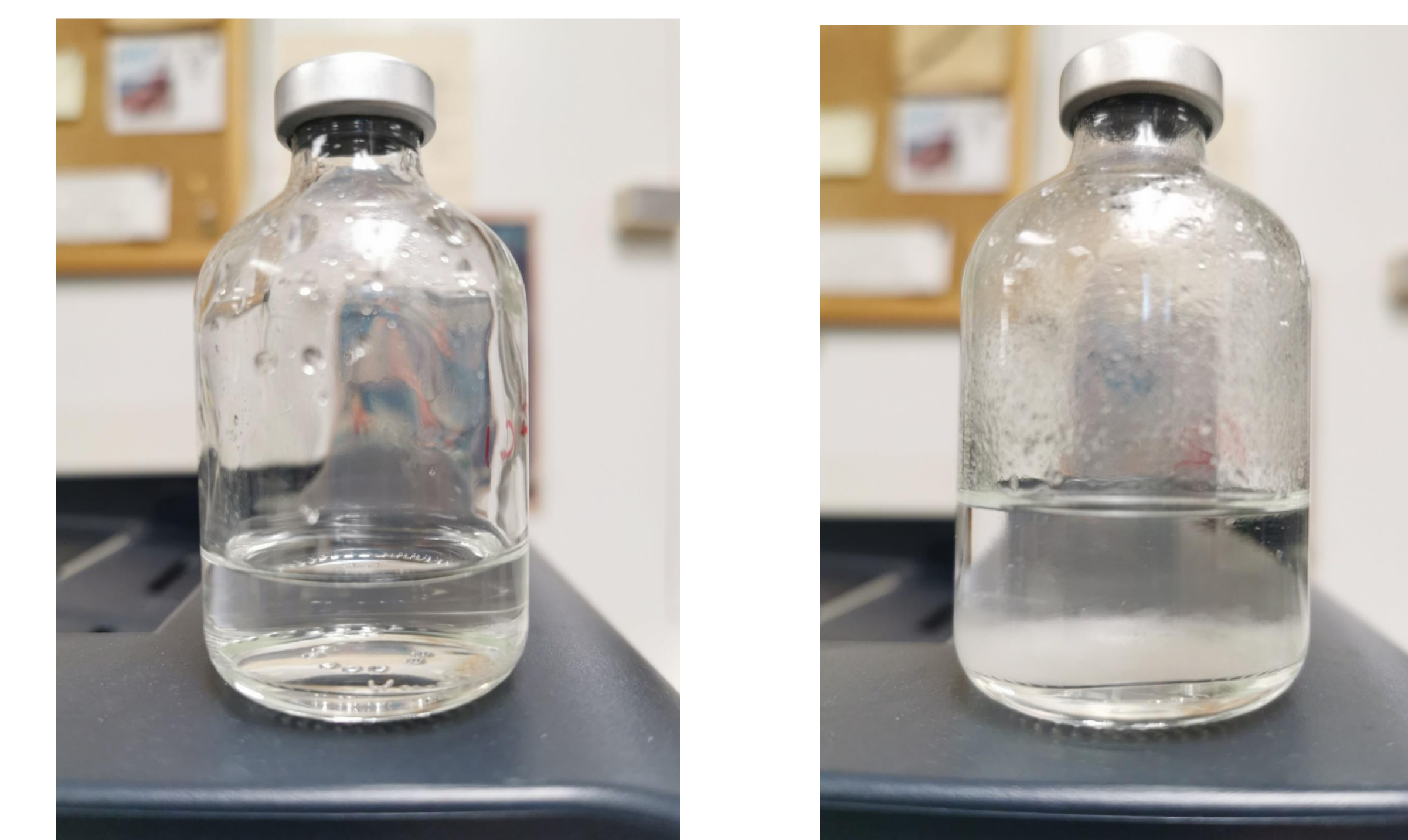
Figure 2. Physical inspection of voriconazole in Isopto Tears 0.5% stored in glass vials at 4°C (left) and 25°C (right) on day 1.

Glass vials and LDPE dropper bottles were visually inspected on each study day. All samples stored at 4°C remained colourless and free of particulate matter for the entire study duration. Samples stored at 25°C formed a milky layer after 1 day (Figure 2), which persisted for the 28 day study duration. The LDPE dropper bottle tip became occluded after day 3.